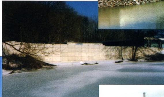
Skydrive Golf Course Pond Elmsford, NY