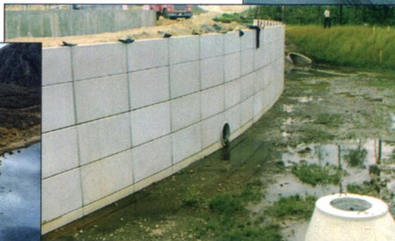
Shaw's Supermarket Storm Water Retention Pond Scarborough, ME

DURABLE COST COMPETITIVE LOCALLY PRODUCED