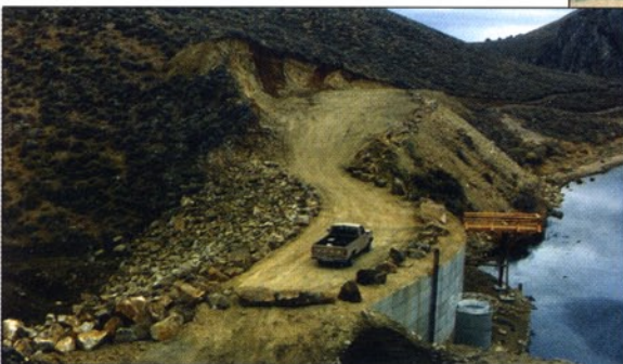
Knott Creek Dam / Reservoir- Humboldt County, NV