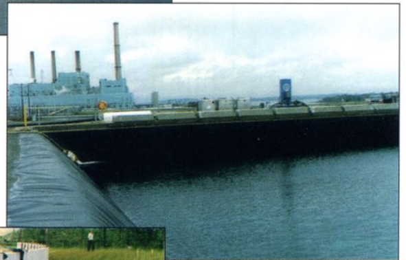
Brayton Point Power Plant Ash Sedimentation Pond Somerset, MA