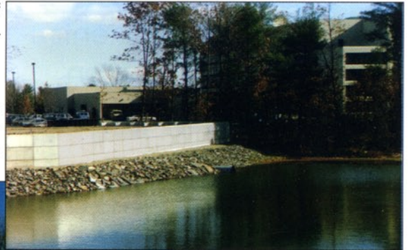
Sable Oaks Retention Pond Portland, ME

Drainage – The T-WALL system is designed to dissipate the hydrostatic pressure that accompanies the rapid draw-down of receding flood waters.